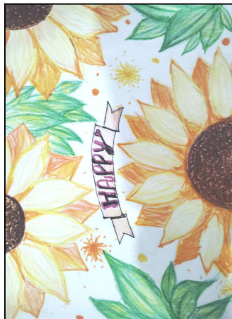
Navisha Prakash - VII(A)