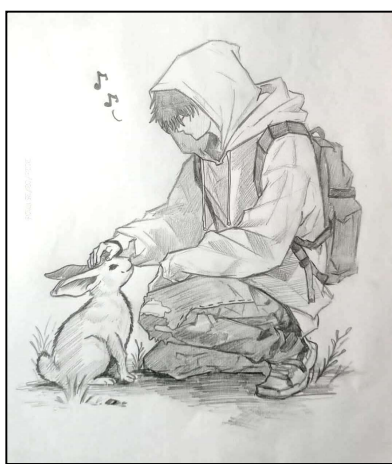
Saumya Saket Acharya – X

A sound so smooth and sweet that it feels like music.